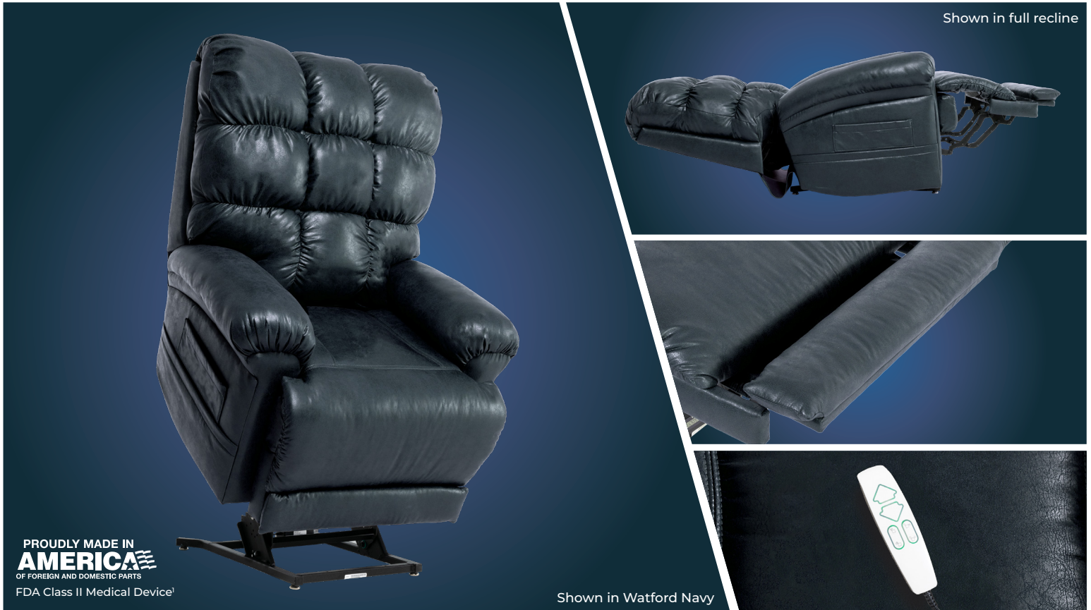
Shown in full recline