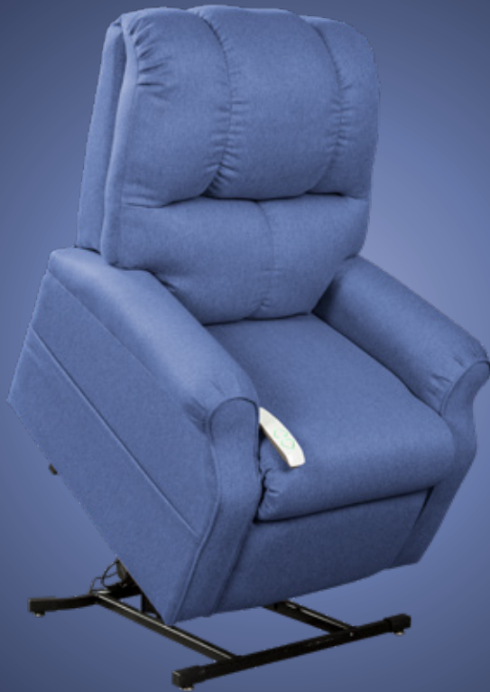
FDA Class II Medical Device¹