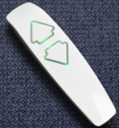
Shown in Pocono Midnight

Whether you want to sit back and relax, watch television or take a nap, you'll love being able to ease into your Mega Motion Power Recline/Lift Chair. This collection offers superb comfort and quiet and smooth performance, all with the push of a button. If you or a loved one needs assistance sitting down or standing back up, Mega Motion Power Recline/Lift Chairs are the perfect choice to regain mobility and confidence.