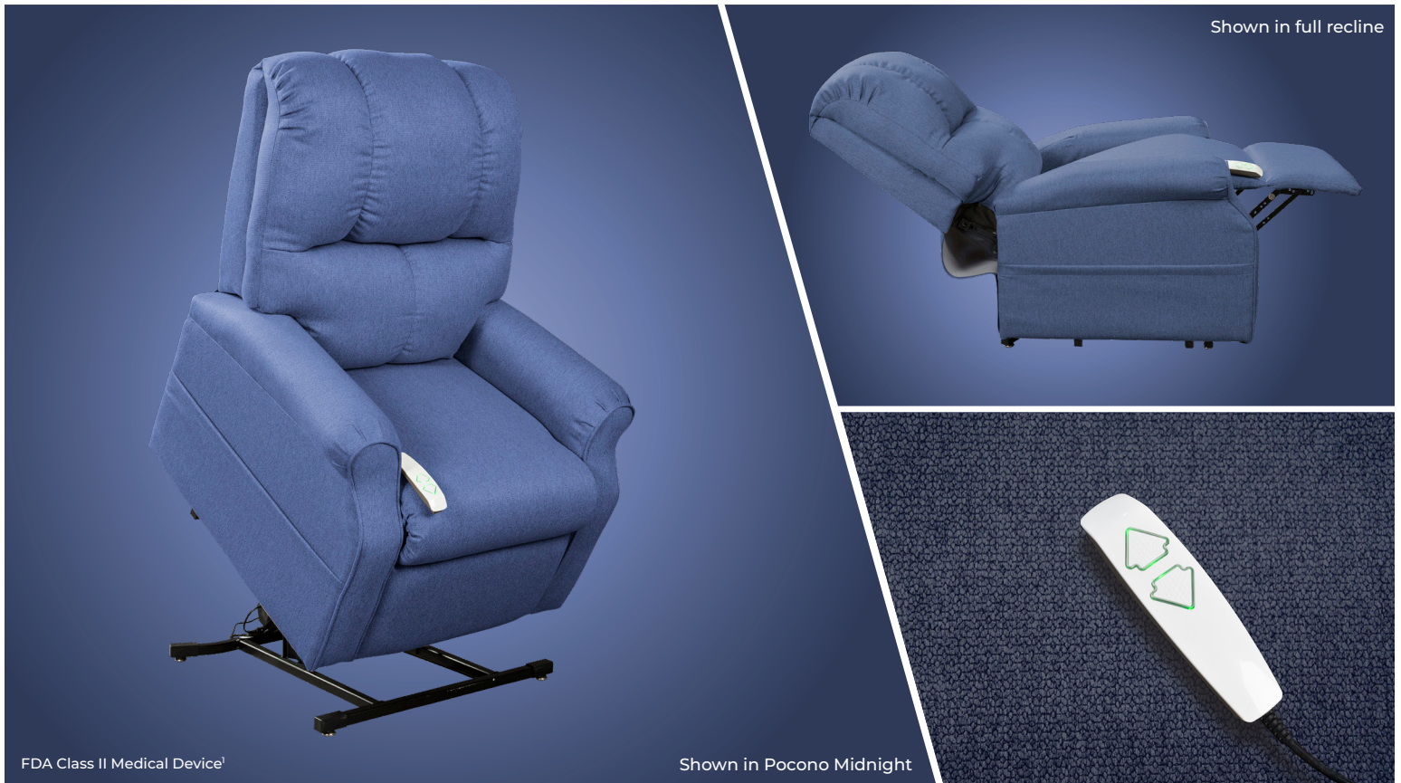
Shown in full recline