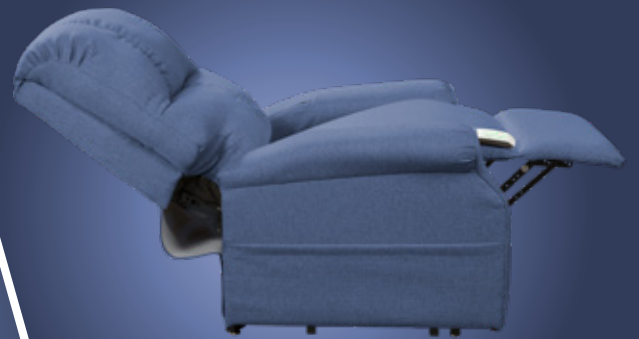
Shown in full recline