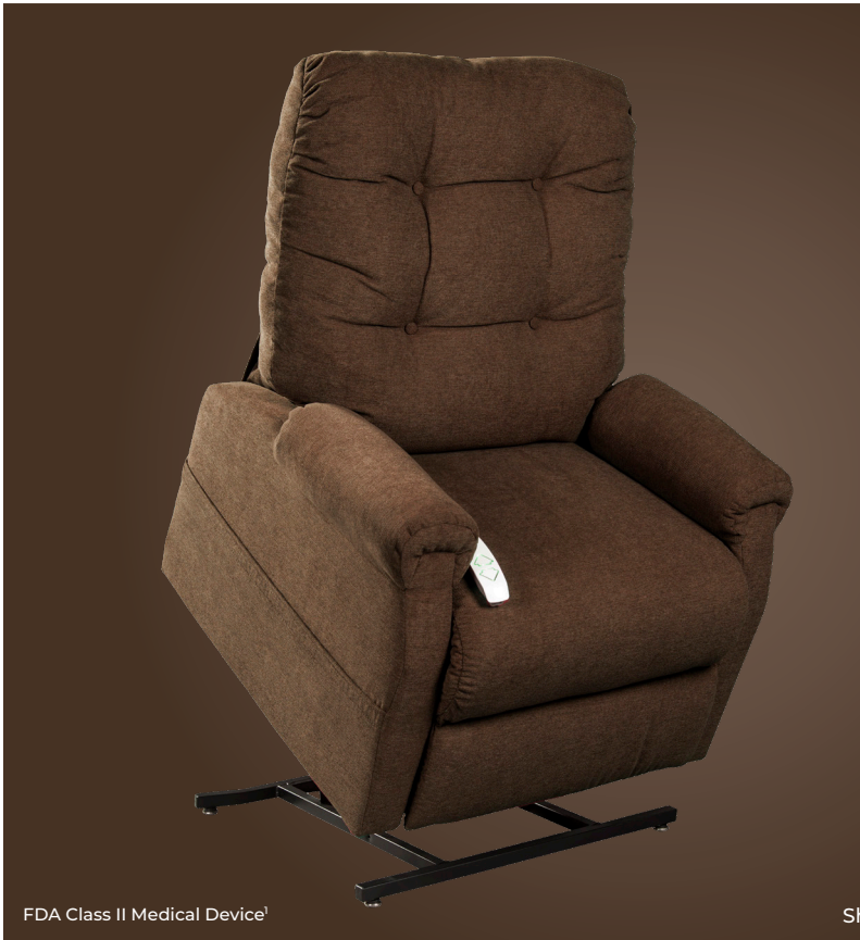
FDA Class II Medical Device 1