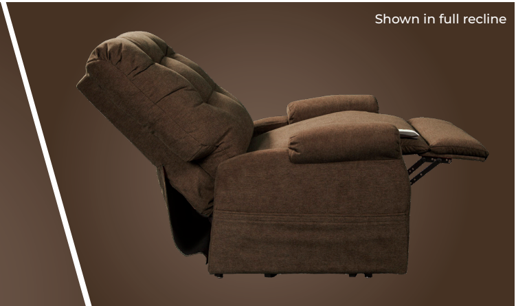
Shown in full recline