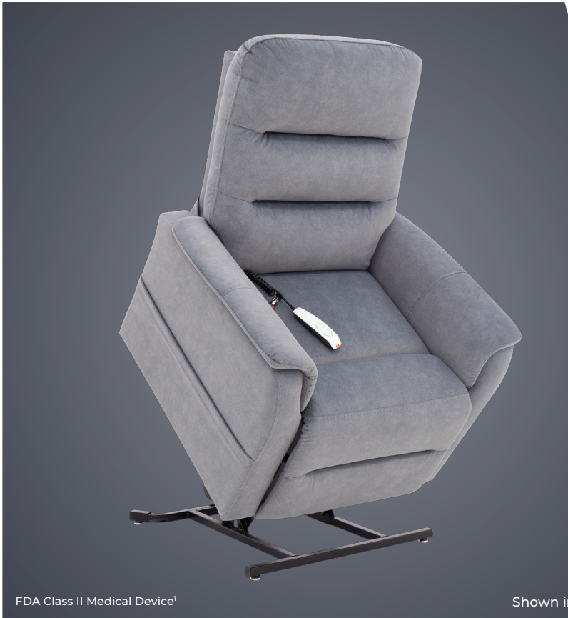
FDA Class II Medical Device 1