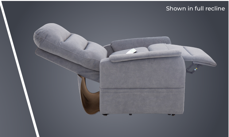
Shown in full recline