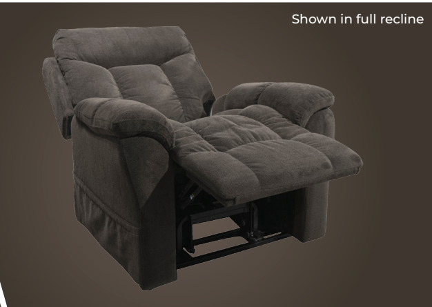
Shown in full recline