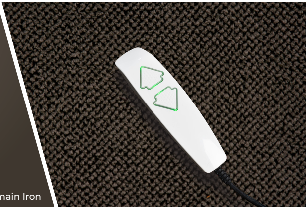
Shown in Domain Iron

Whether you want to sit back and relax, watch television or take a nap, you'll love being able to ease into your Mega Motion Power Recline/Lift Chair. This collection offers superb comfort and quiet and smooth performance, all with the push of a button. If you or a loved one needs assistance sitting down or standing back up, Mega Motion Power Recline/Lift Chairs are the perfect choice to regain mobility and confidence.