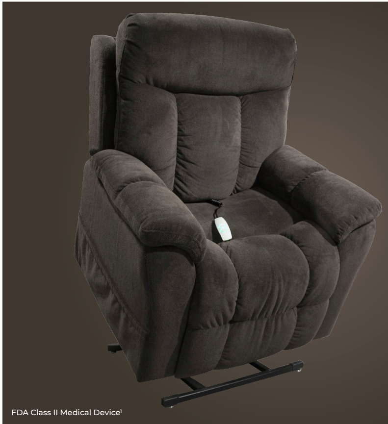
FDA Class II Medical Device 1