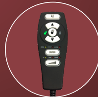
Remote with Standard Heat & Massage